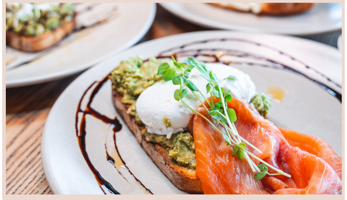
Please order at counter | 10% Surcharge applies on all public holidays