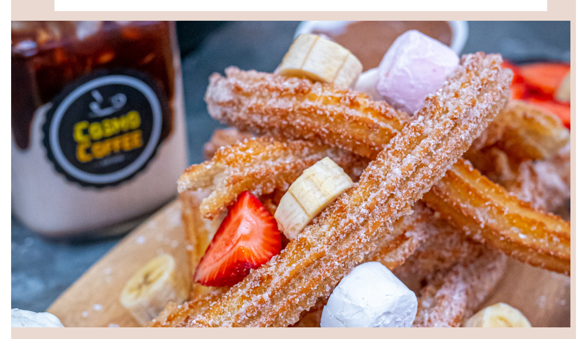
Please order at counter | 10% Surcharge applies on all public holidays

Extras Vanilla ice cream | Chocolate Shot Blueberries | Strawberries | Banana